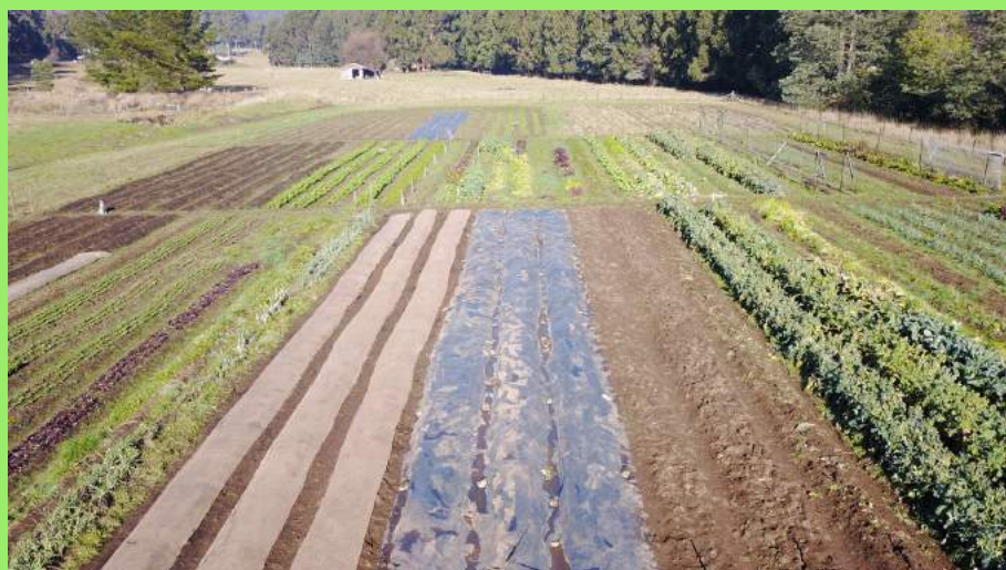
Aerial view of Scrubby Hill Market Garden

Next month – more on propagation and a potting mix rundown.