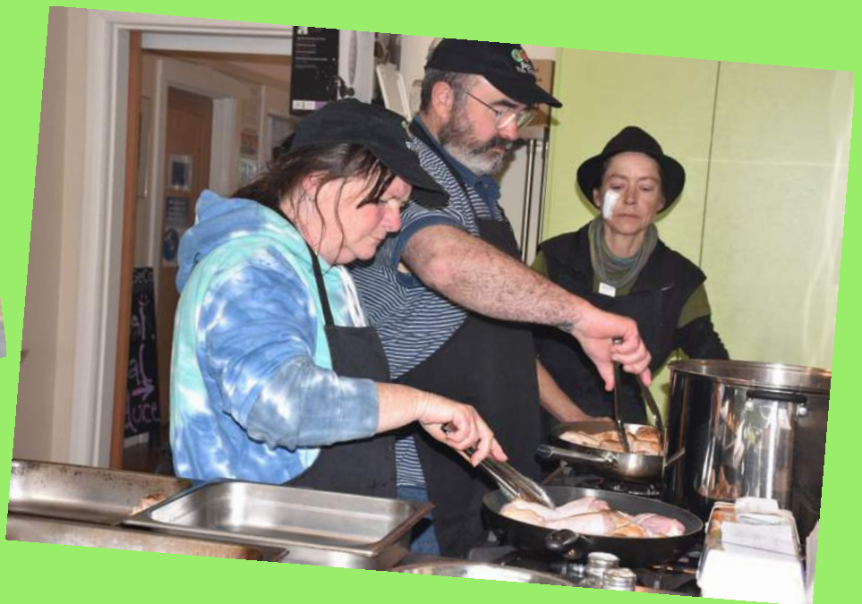
Photo some of the meals created at the centre and our conscientious cooks!